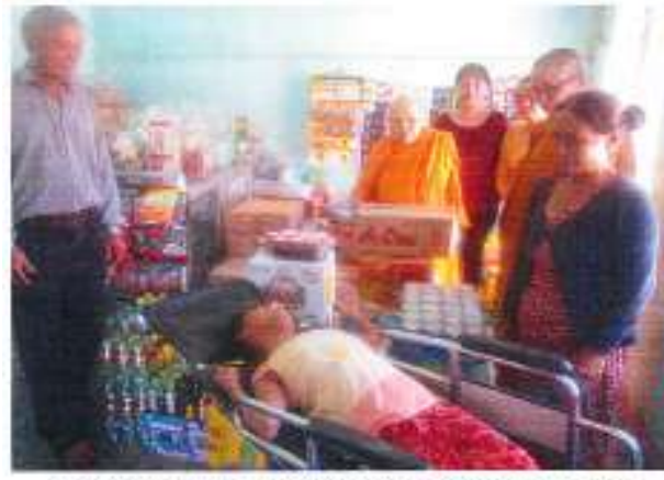
Assisted in opening a mart at home so that the Mother can continue to provide support for her disabled daughter.