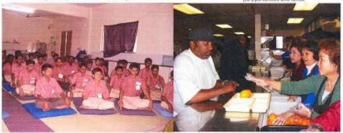
Heiped deaf children in India to improve their skills.