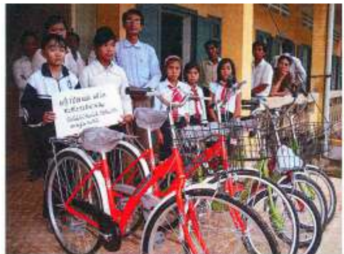
Bicycles help students in remote villages attend school