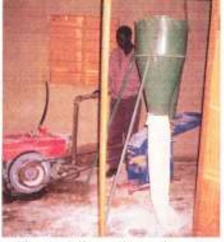
Mill machine in Africa provides poor villegers with job pportunities and funds.