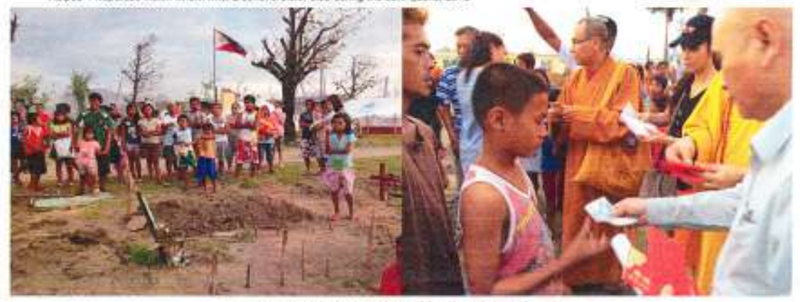
Assetus $17,000 to victime of typhoon Heigen in Philippines, 2013