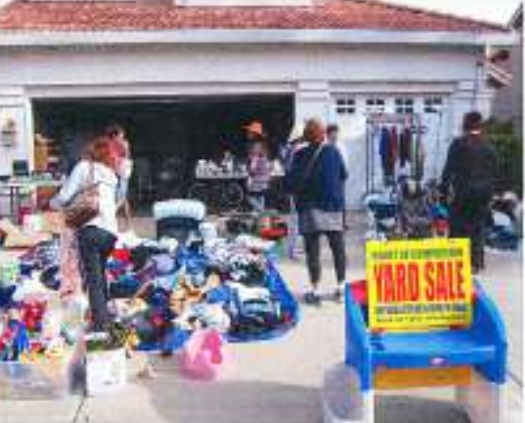
Yard Sale to fundraise!